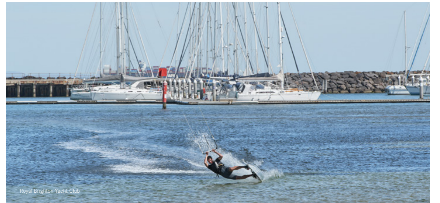
Royal Brighton Yacht Club