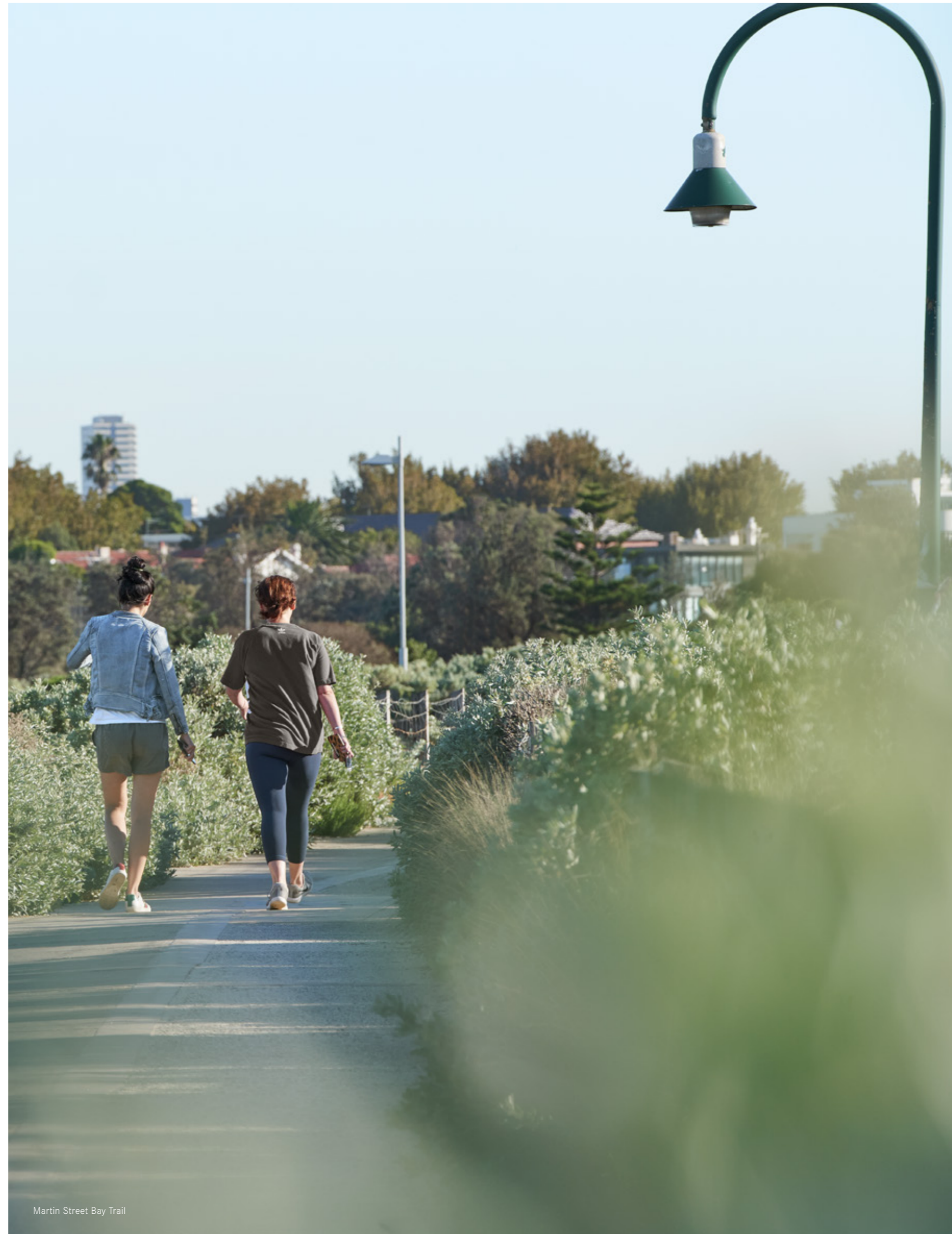
Martin Street Bay Trail

An outdoor lifestyle is a healthy lifestyle, and nothing encourages this outlook more than a community that's fresh and active. Surrounding parks, established tree-lined streets, and a location just minutes from the beach mean healthier decisions become second nature at Martin.