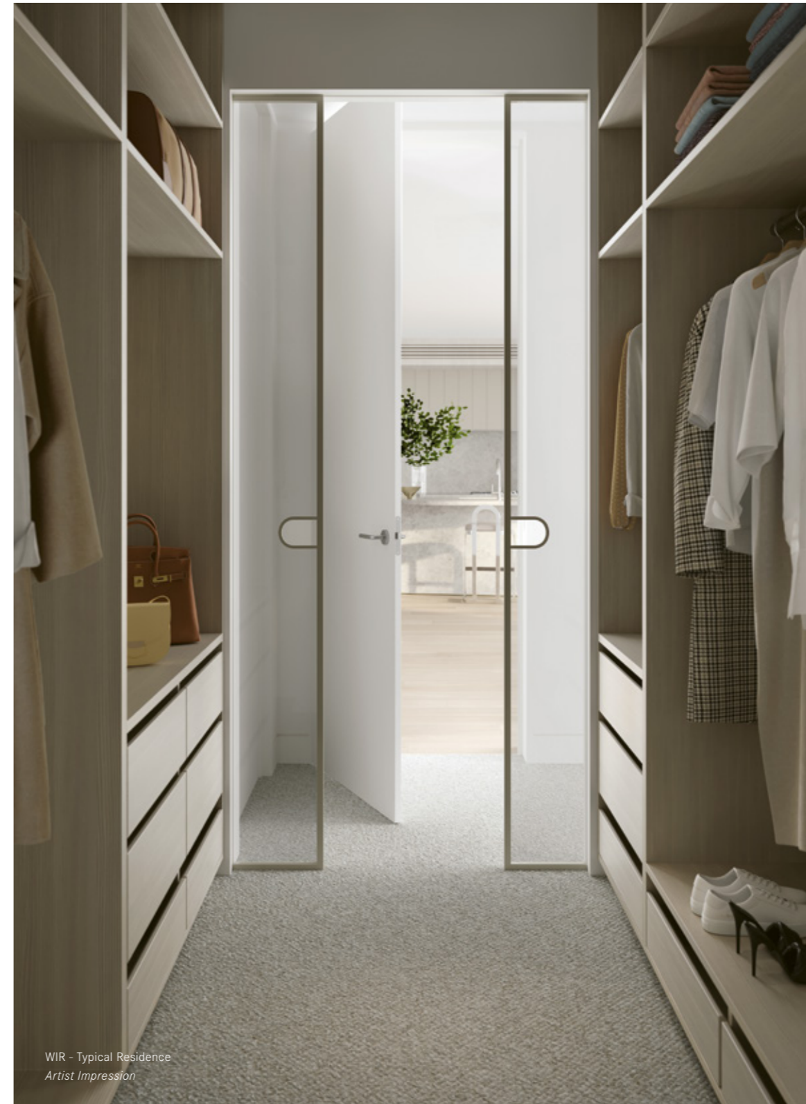
WIR - Typical Residence Artist Impression