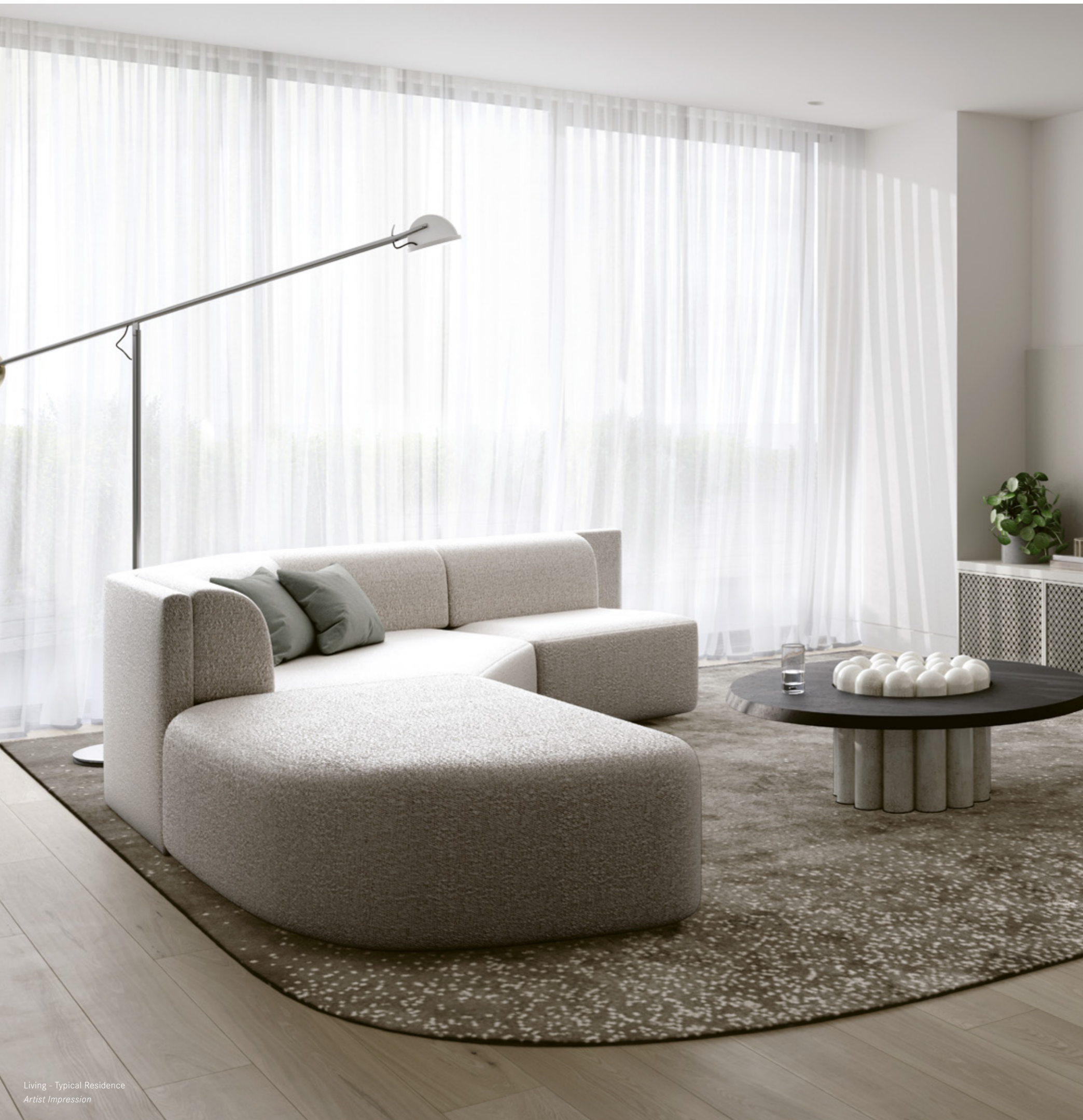
Living - Typical Residence Artist Impression