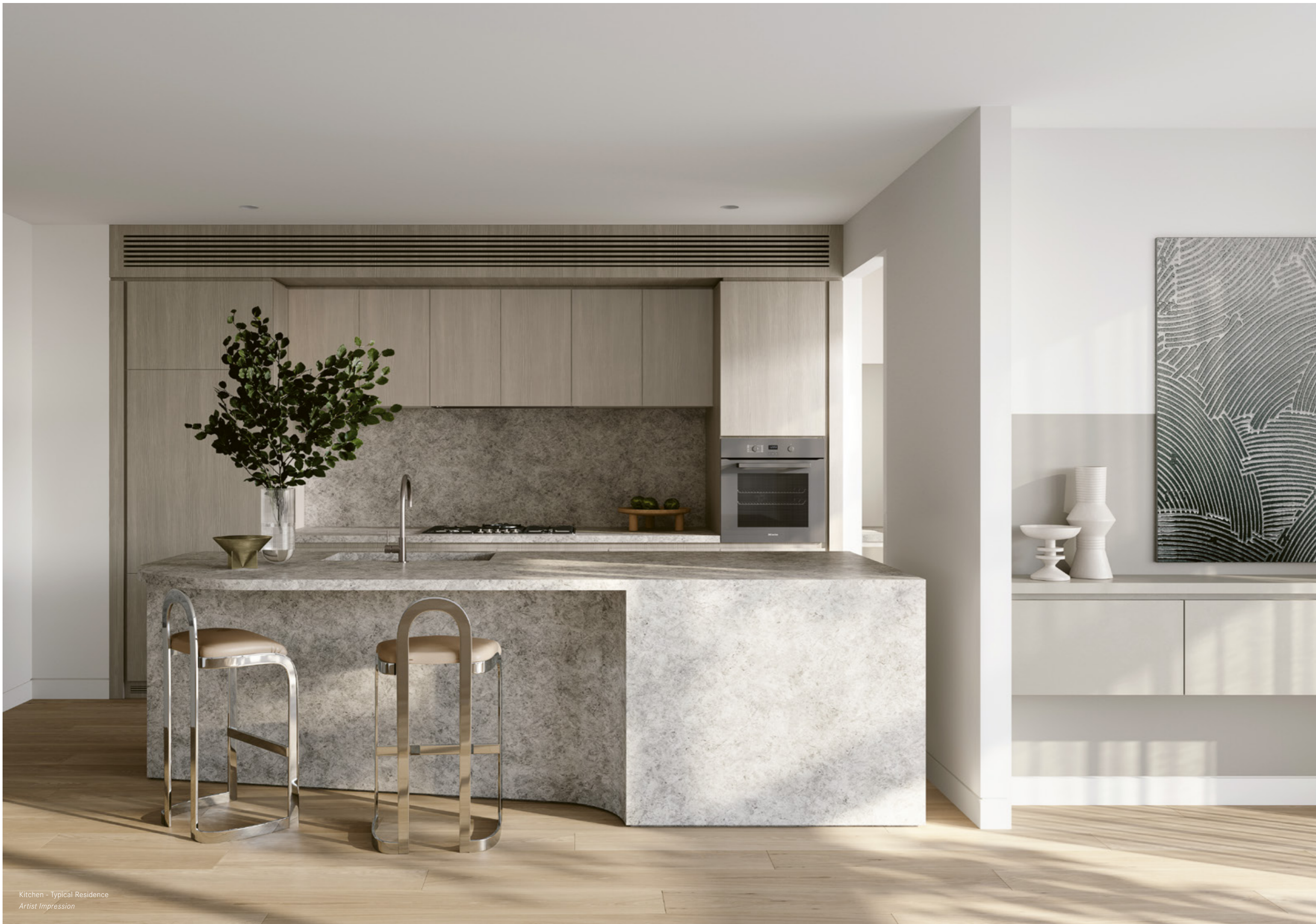
Kitchen - Typical Residence Artist Impression