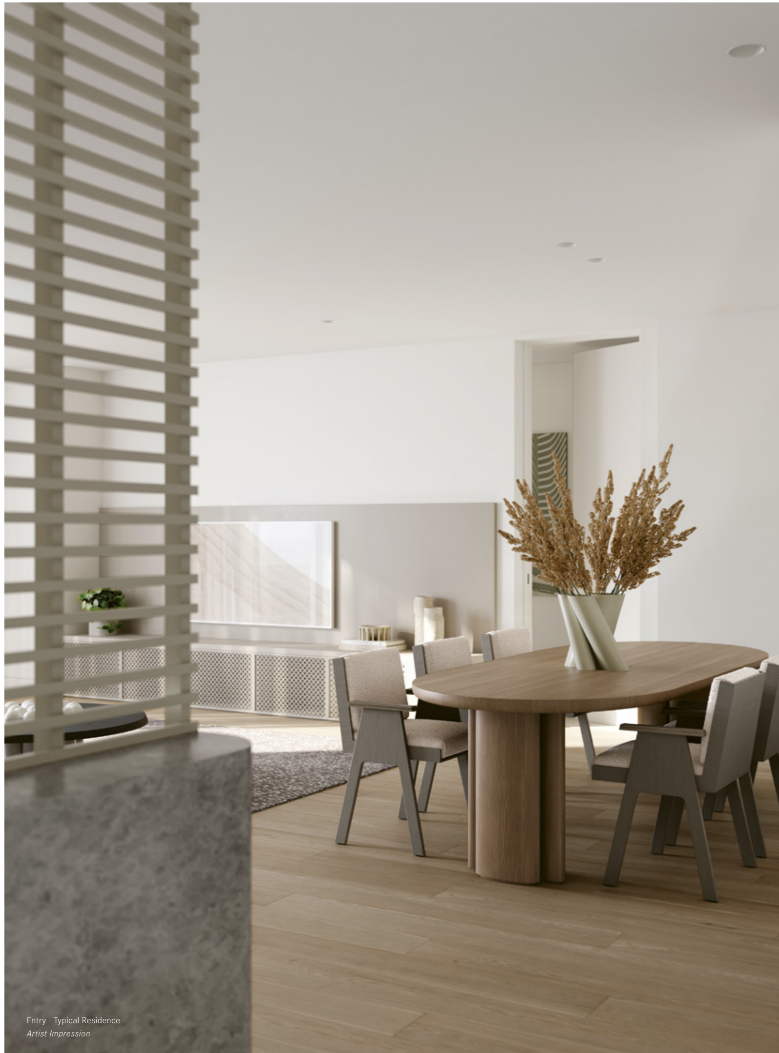
Entry - Typical Residence Artist Impression