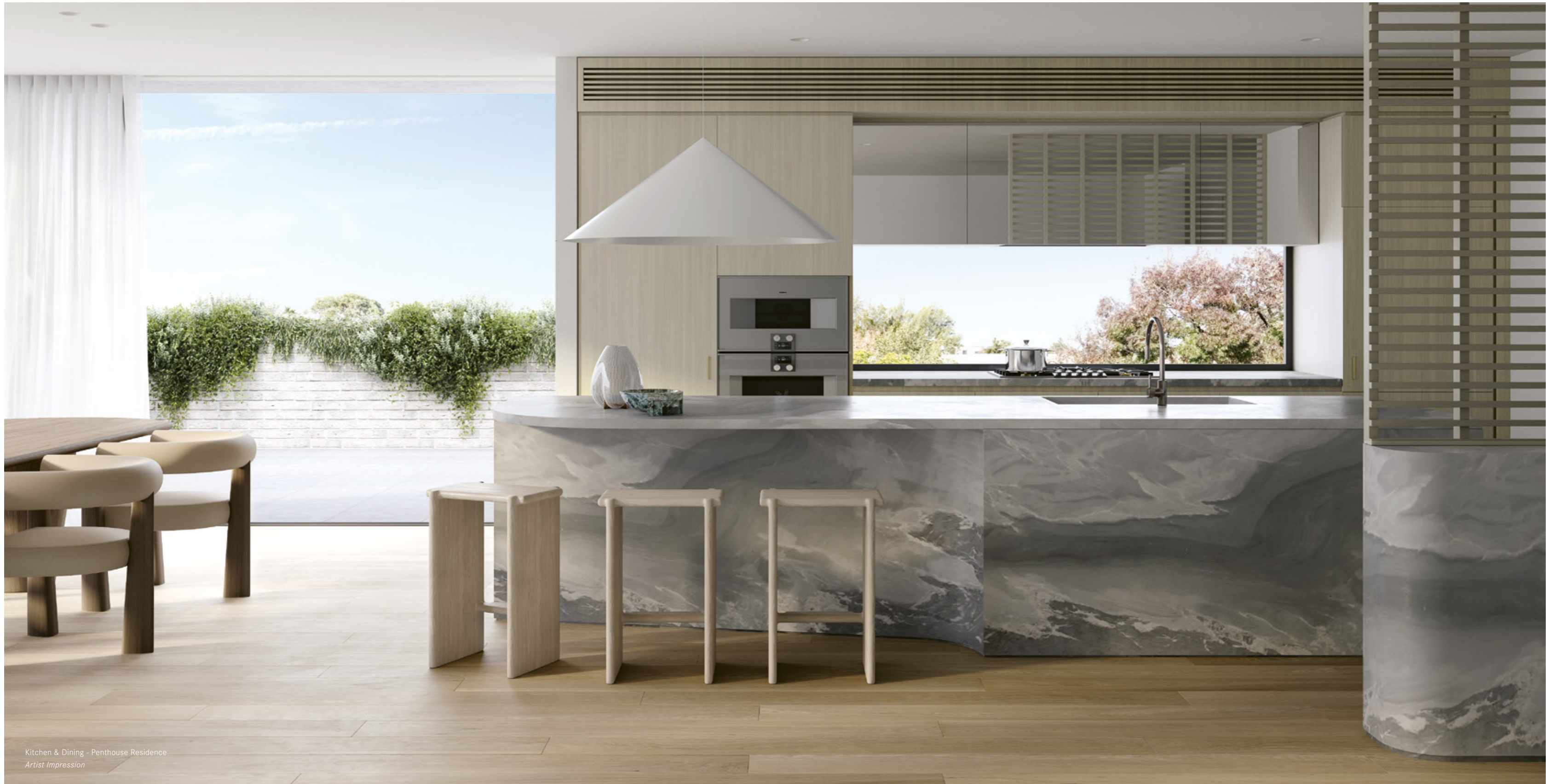
Kitchen & Dining - Penthouse Residence Artist Impression