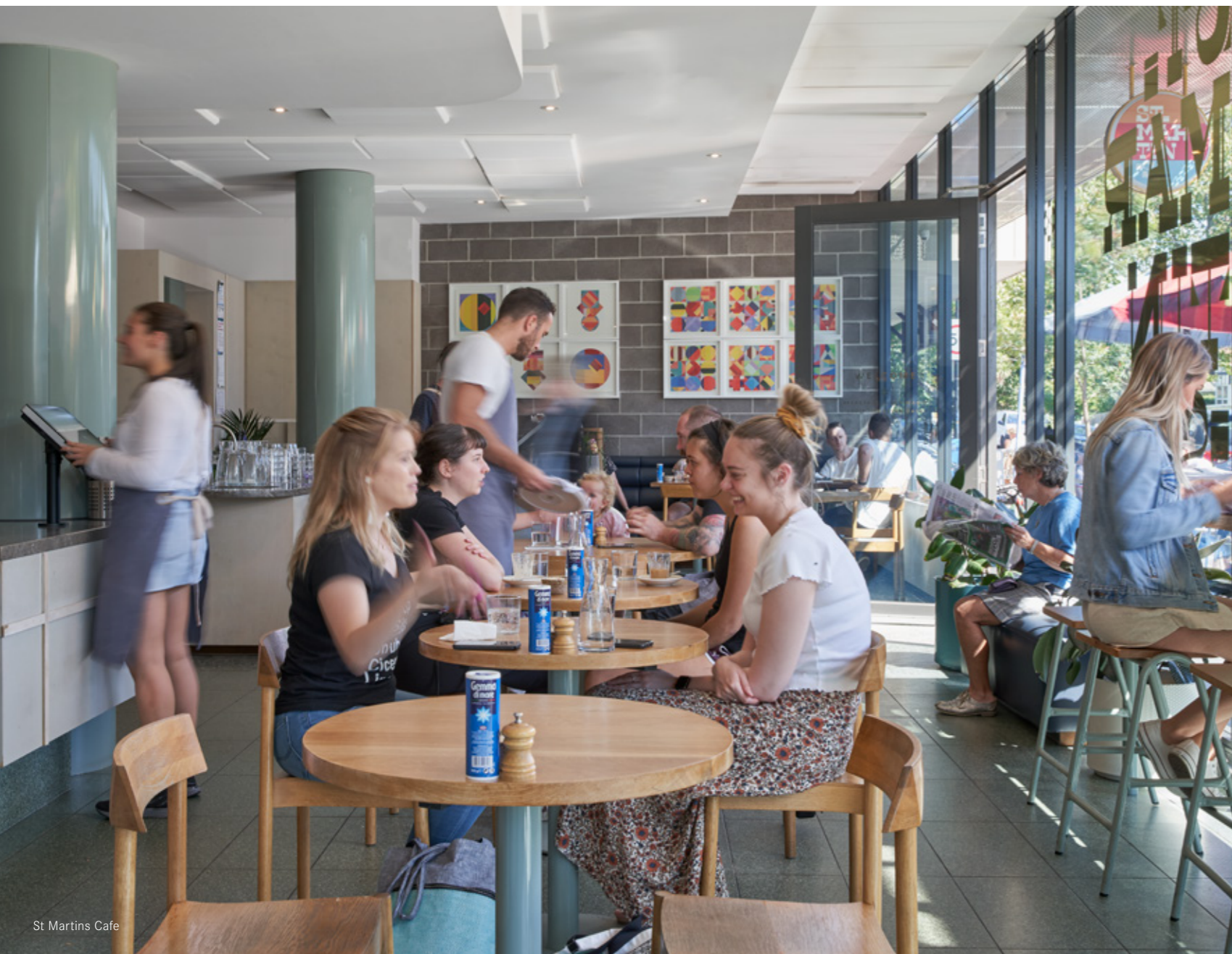
St. Martins Cafe