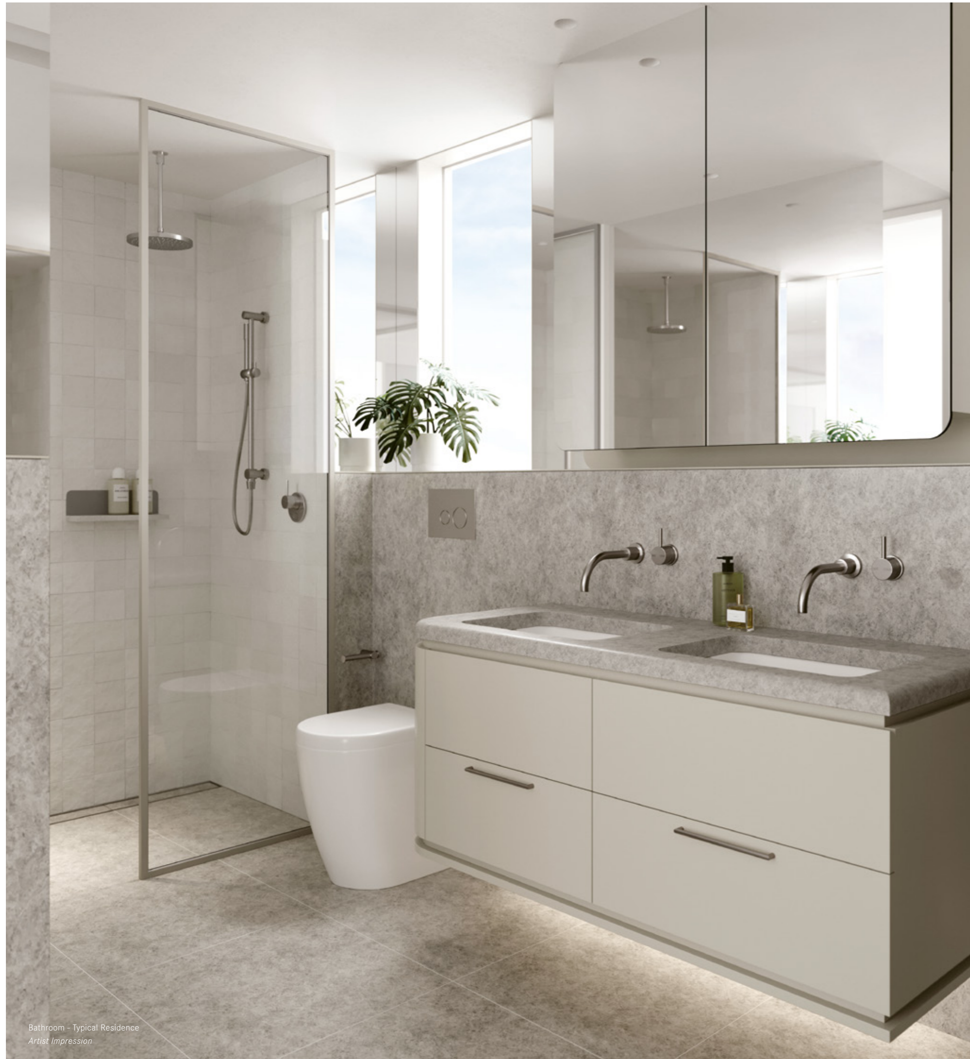
Bathroom - Typical Residence Artist Impression