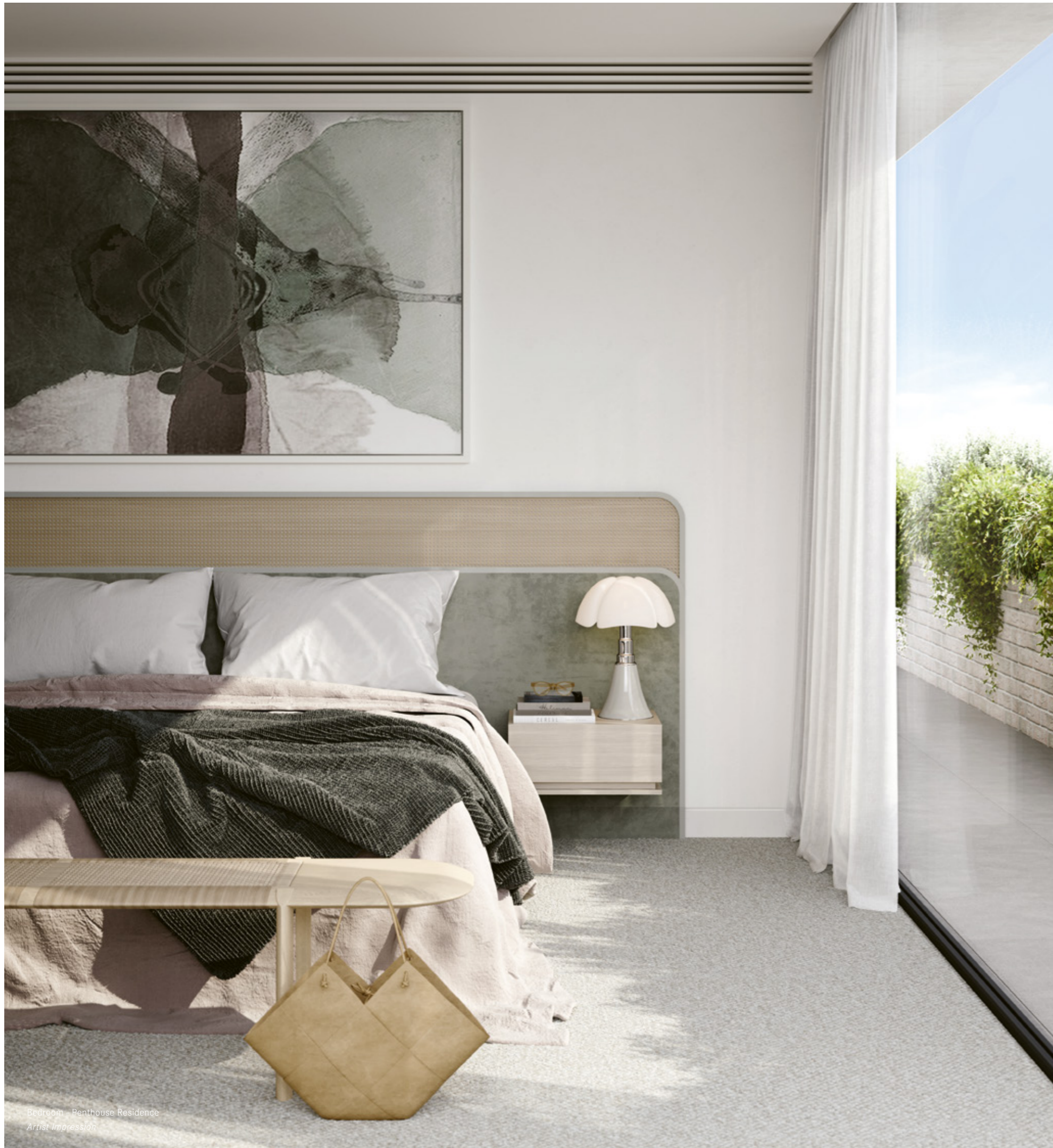
Bedroom - Penthouse Residence Artist Impression