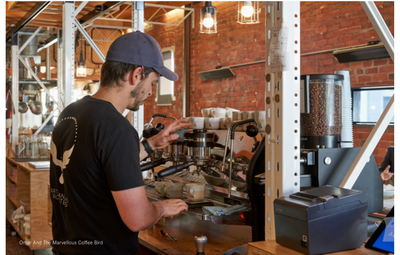
Omar And The Marvellous Coffee Bird