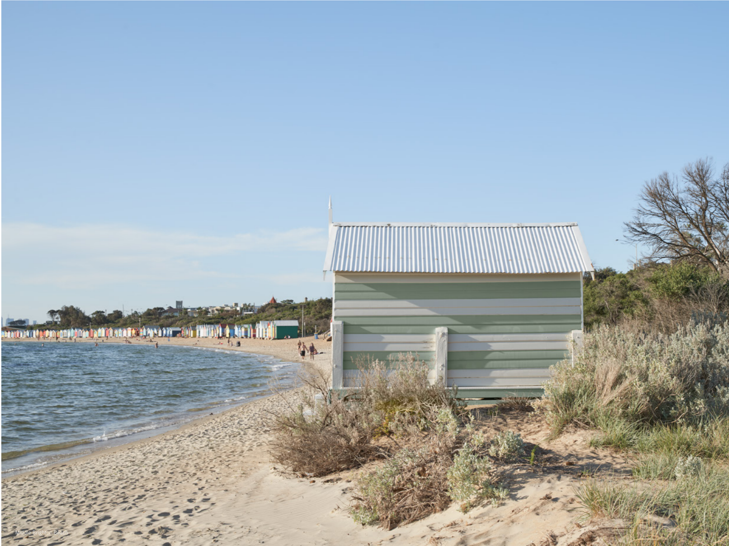
Middle Brighton Beach

The prestigious Brighton lifestyle has a reputation all of its own. This long-desirable, long-established suburb is a benchmark for the kind of living only Melbourne can deliver. A step away from the city and a short walk to the coastline, Martin enables complete immersion into this vibrant community whilst offering a tranquil retreat at the end of the day.