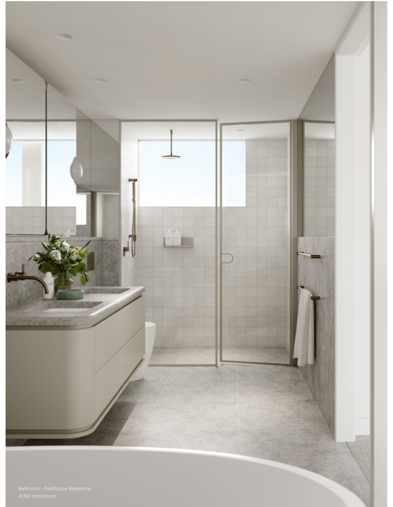
Bathroom - Penthouse Residence Artist Impression