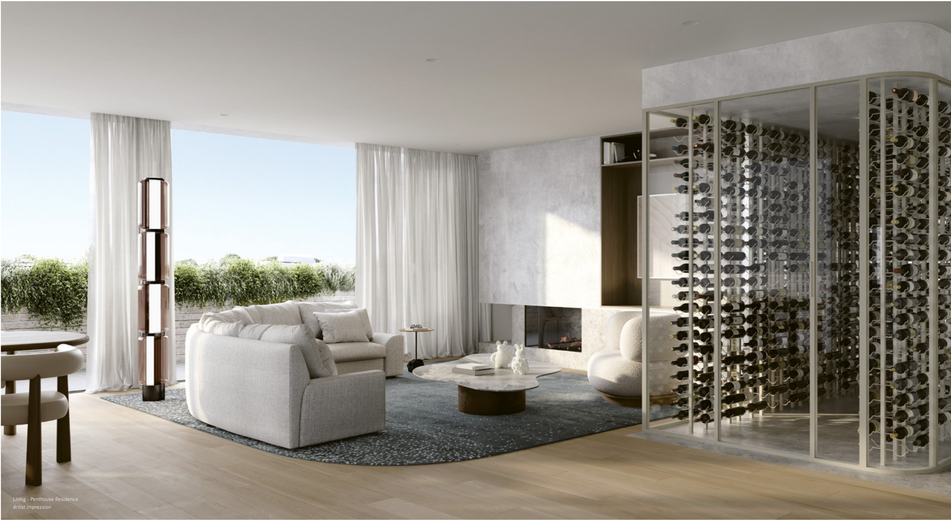
Living - Penthouse Residence Artist Impression