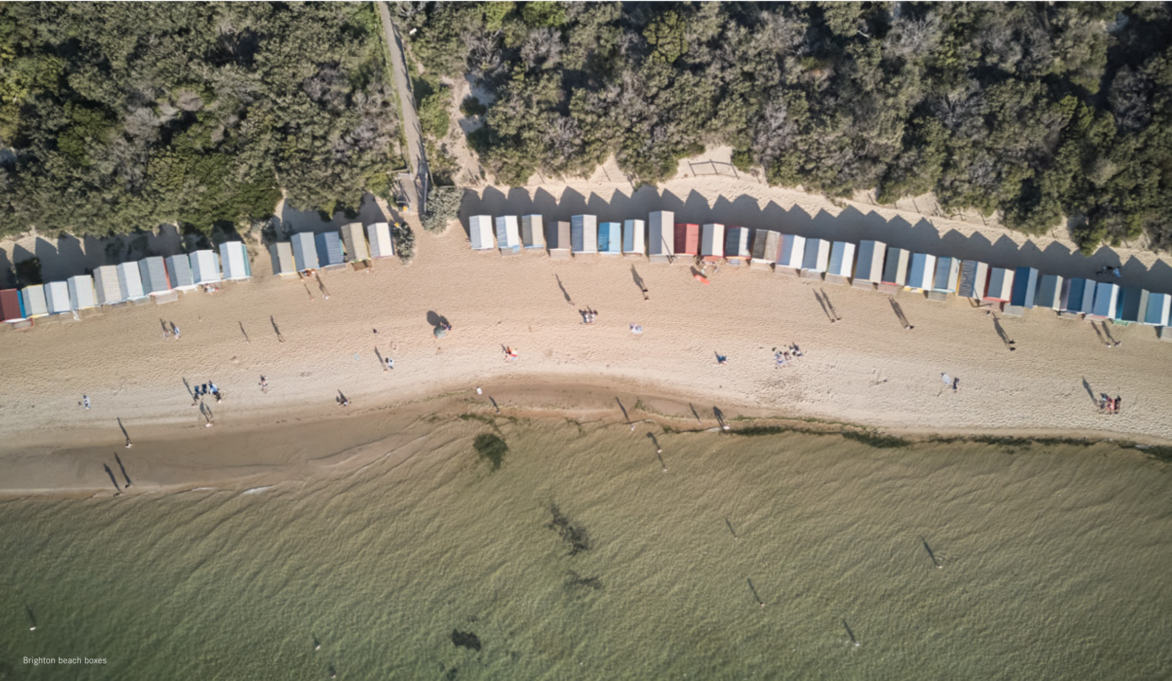
Brighton beach boxes