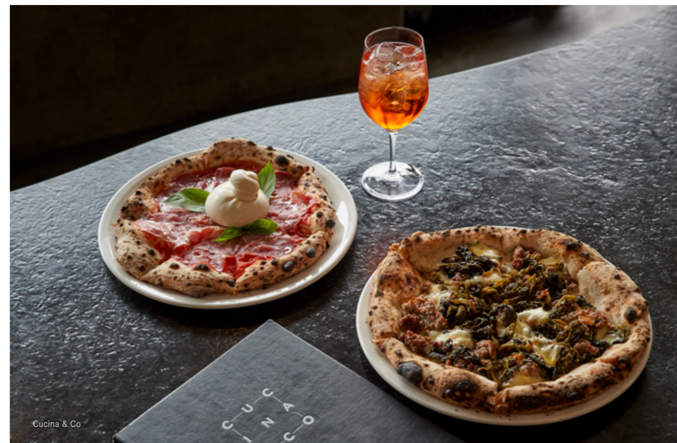
Cucina & Co