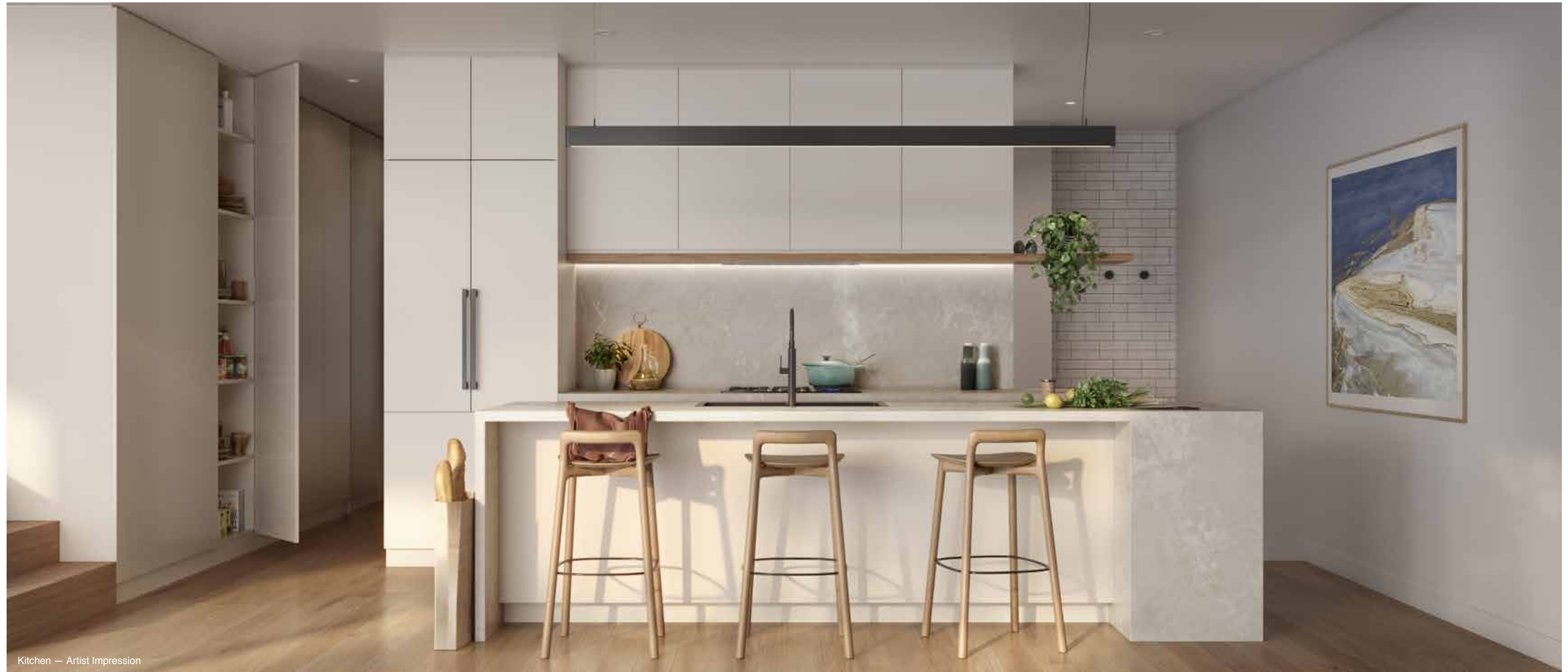
Kitchen — Artist Impression

Being one with nature was a key inspiration for the design. Open plan kitchen areas and oversized living rooms flow through to the leafy green expanse of your own private courtyard. The balance between indoor and outdoor living spaces reflects the modern Australian attitude – relaxed yet refined. A warm material palette provides pops of colour and texture while Australian timber features add unique character.