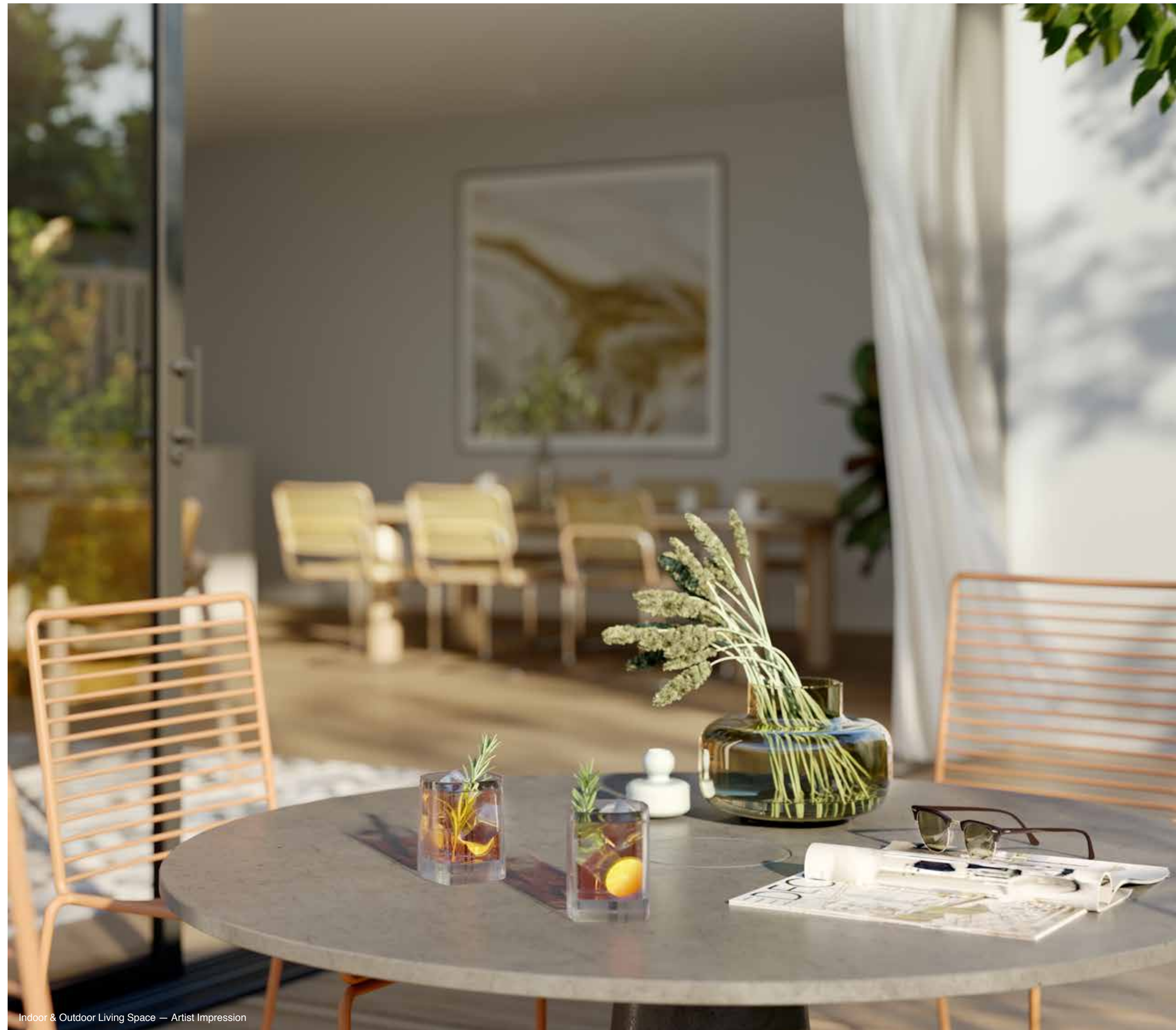
Indoor & Outdoor Living Space — Artist Impression

The ample volume of light and space within each New Ormond townhouse encourages residents to make the most of time spent at home. In every direction, large windows let in natural daylight, reinforcing a connection to the outdoors. Designed to be both private and open, the living spaces allow plenty of room to spread out and entertain guests.