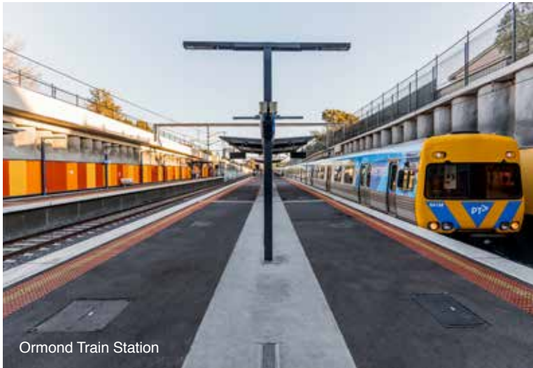
Ormond Train Station