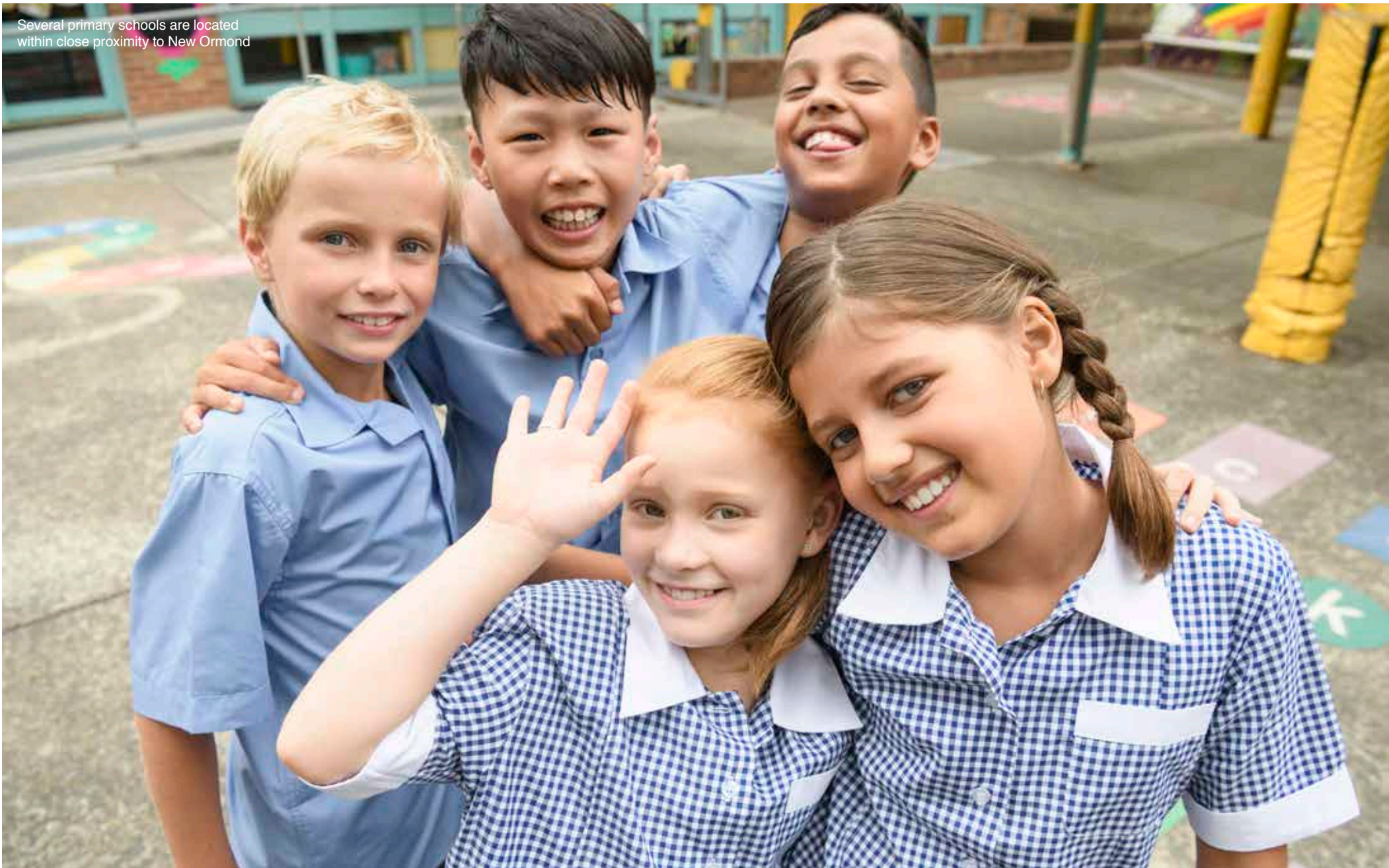
Several primary schools are located within close proximity to New Ormond