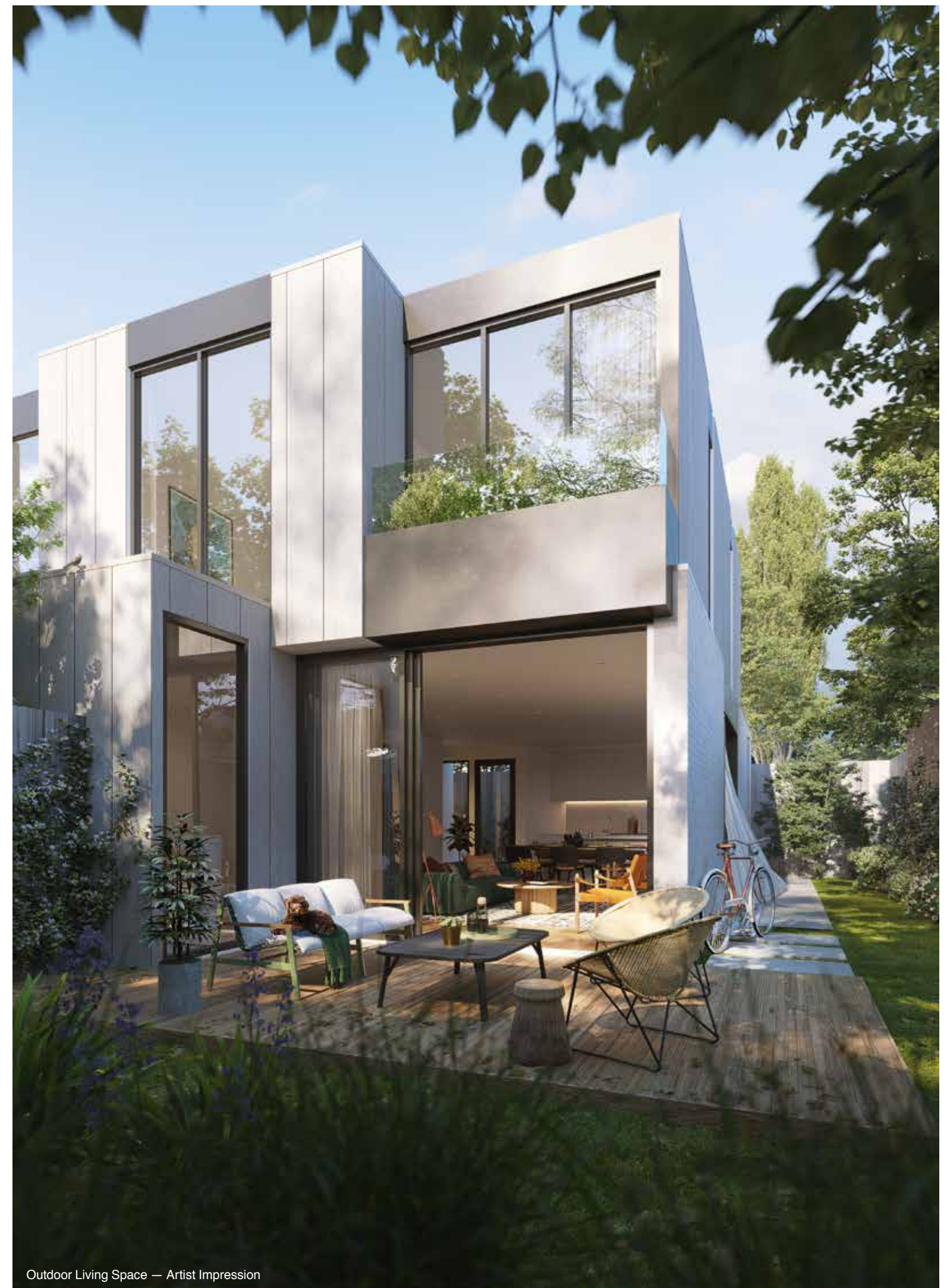
Outdoor Living Space — Artist Impression

Rising above and beyond what's expected, New Ormond offers an enviable lifestyle for those seeking both natural surroundings and proximity to the city.