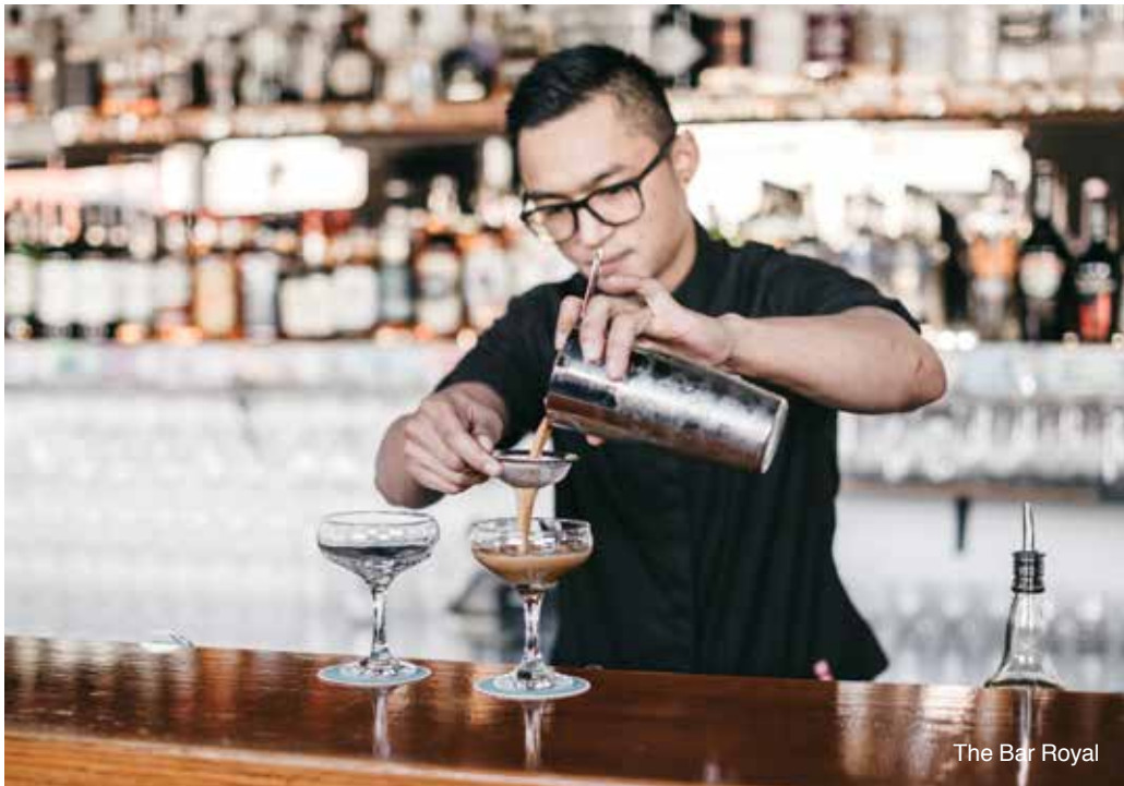
The Bar Royal

Ormond is bursting with colour, flavour and personality. Quirky cafes such as Left Field and Mr Brightside serve some of the city's best flat whites and creative all-day breakfasts. Local wine bars such as Blue Tongue and Milton provide a cosy place to unwind after work while live music venue On Top offers conclusive proof that rooftops bars exist outside Melbourne's CBD.