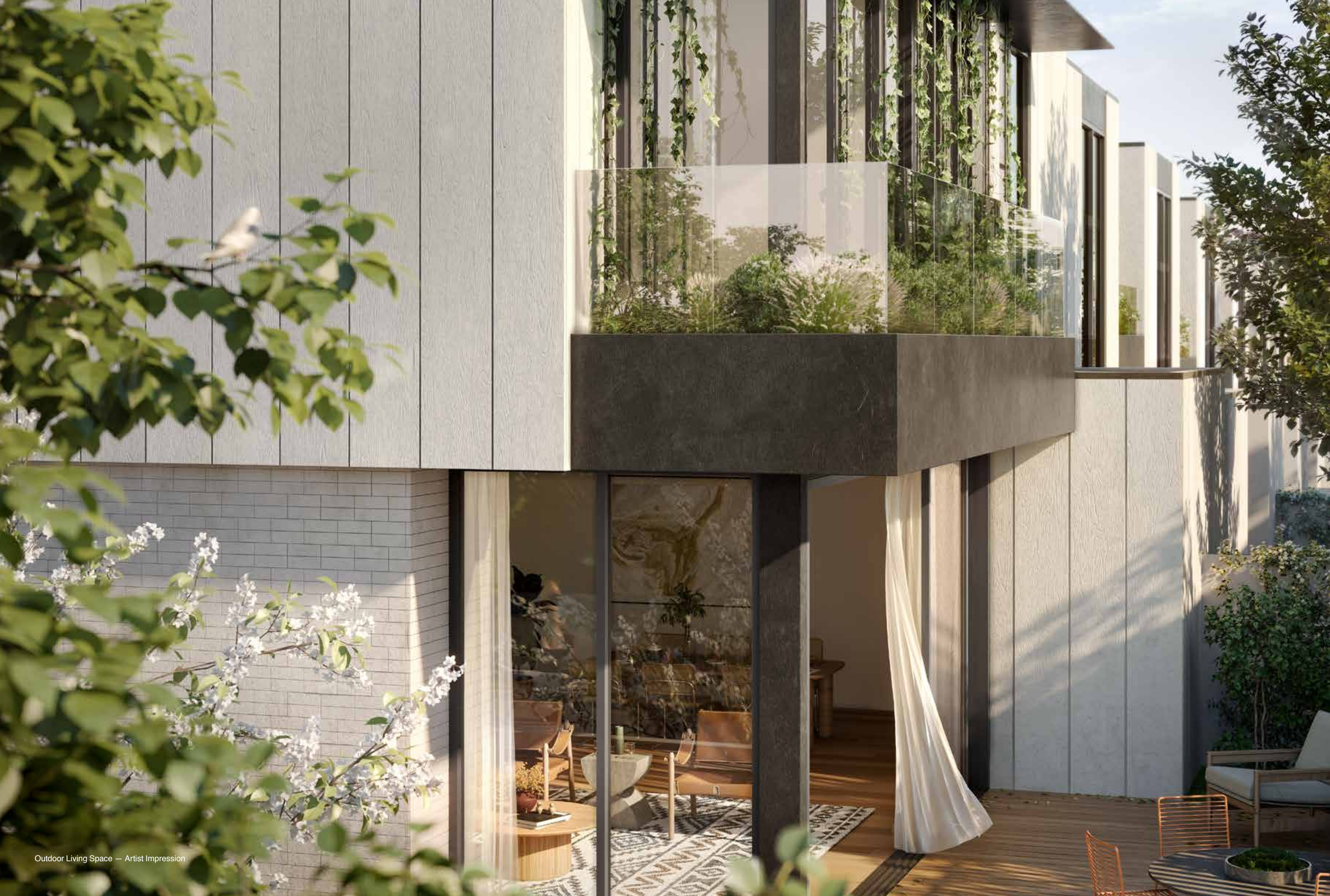
Outdoor Living Space — Artist Impression