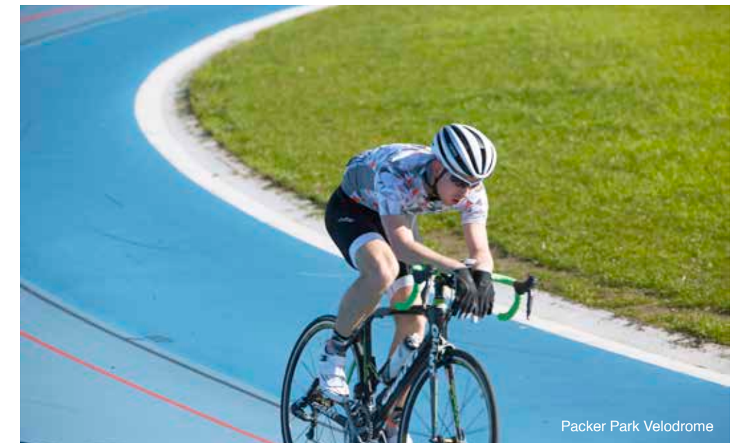
Packer Park Velodrome

The lush EE Gunn Reserve is home to Ormond Amateur Football Club, Ormond Tennis Club and Ormond Cricket Club. Nearby, Duncan Mackinnon Reserve contains one of Victoria's best athletics tracks and a range of fitness stations.