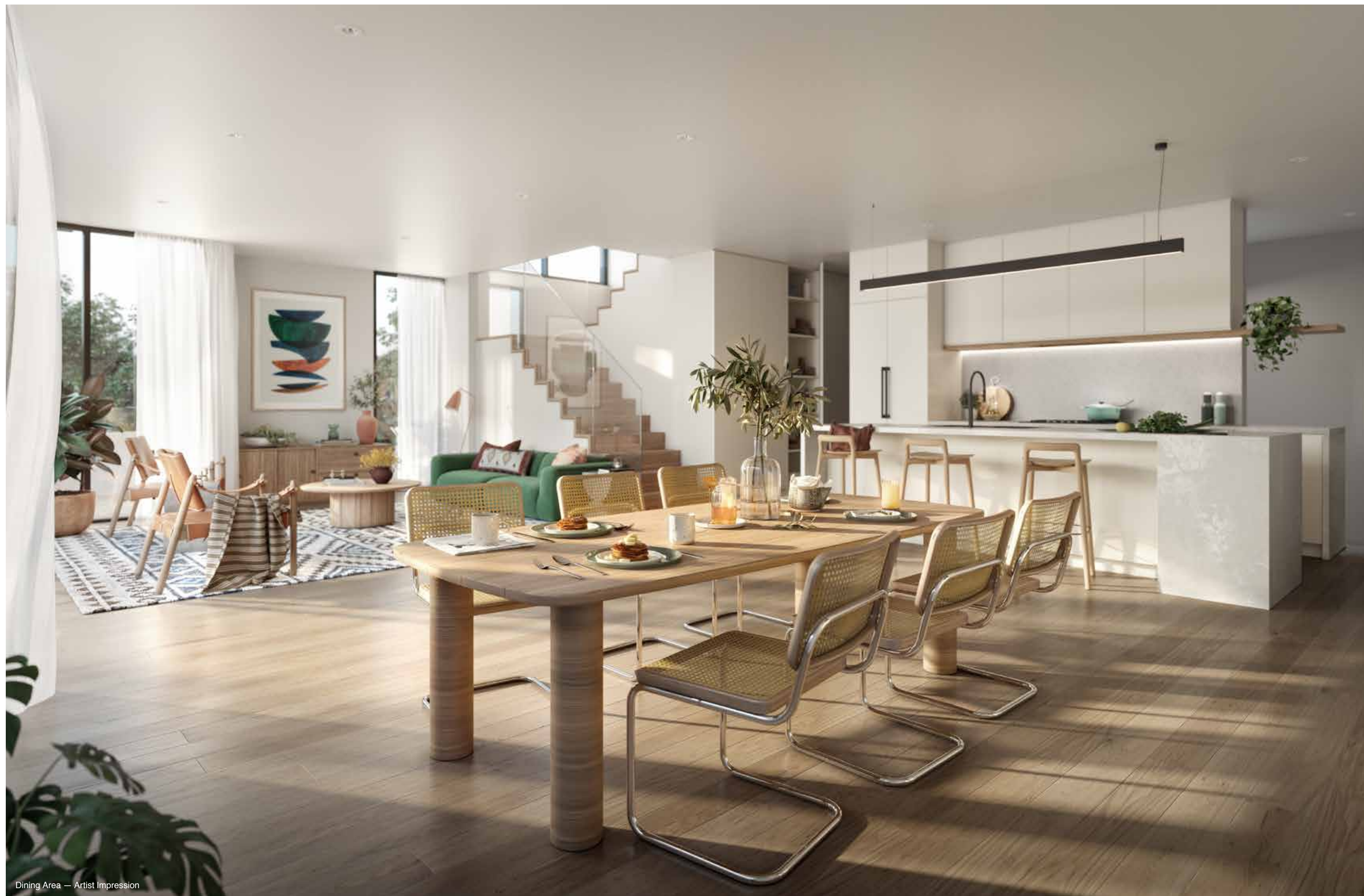
Dining Area — Artist Impression