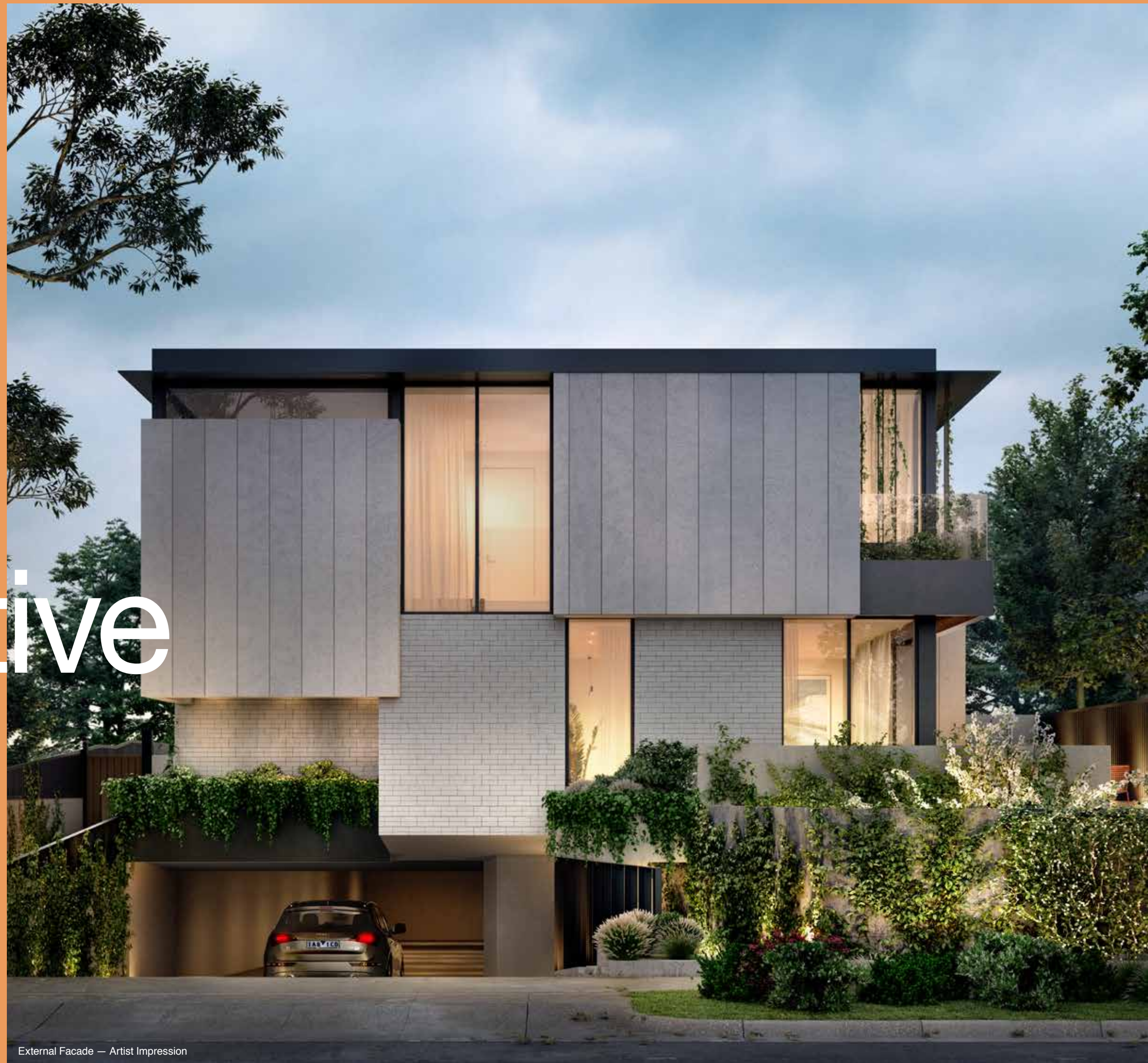
External Facade — Artist Impression

New Ormond sits within easy reach of the city but exchanges congested streets for leafy surrounds. Enveloped by greenery, this collection of seven spacious townhouses is the considered outcome of a creative collaboration between Sloane, Megowan Architectural and John Patrick Landscaping.