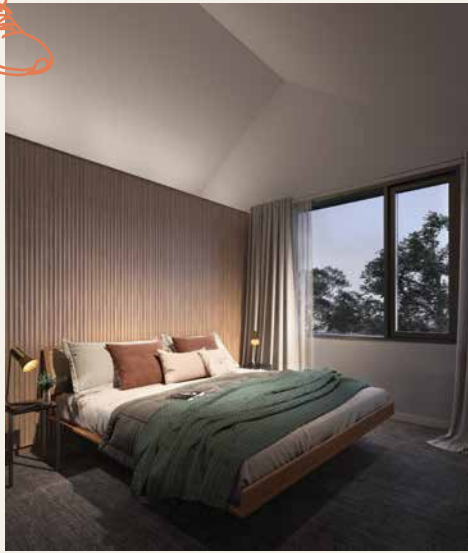
Bedroom, artistic impression