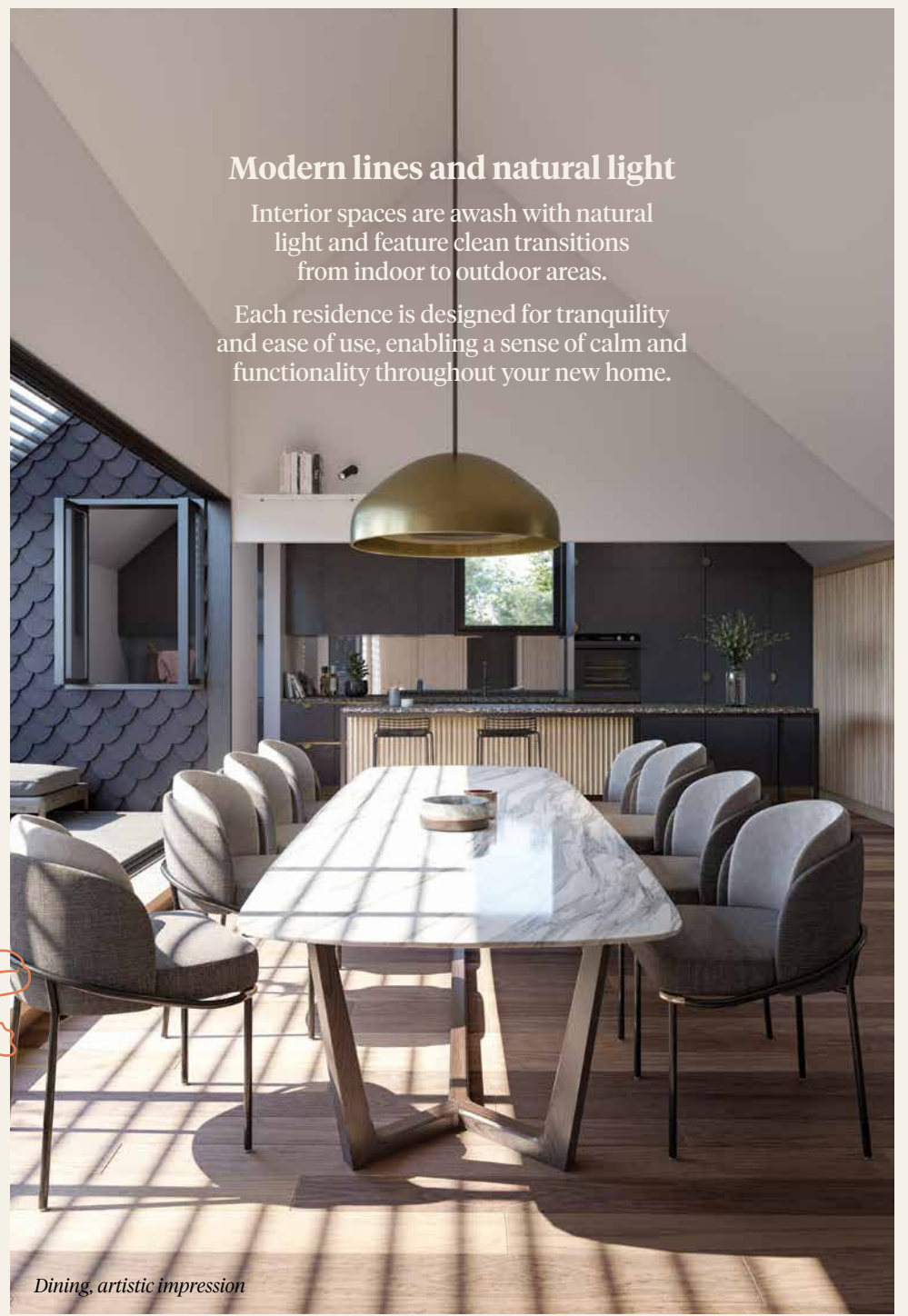
Dining, artistic impression