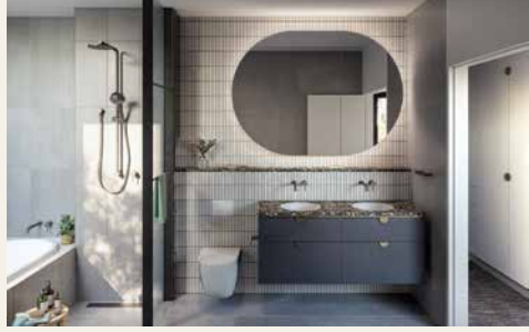
Bathroom, artistic impression